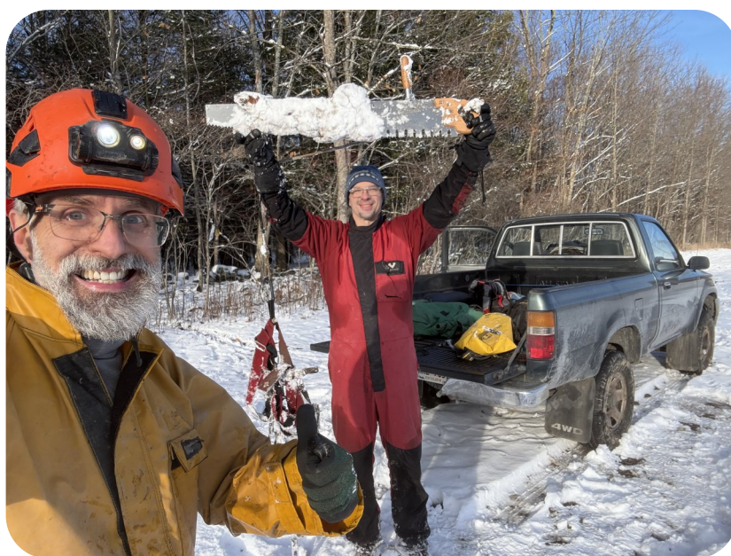
Volunteering at Sellecks Karst Preserve.