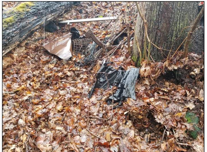
Cleanup on the Sellecks Karst Preserve.