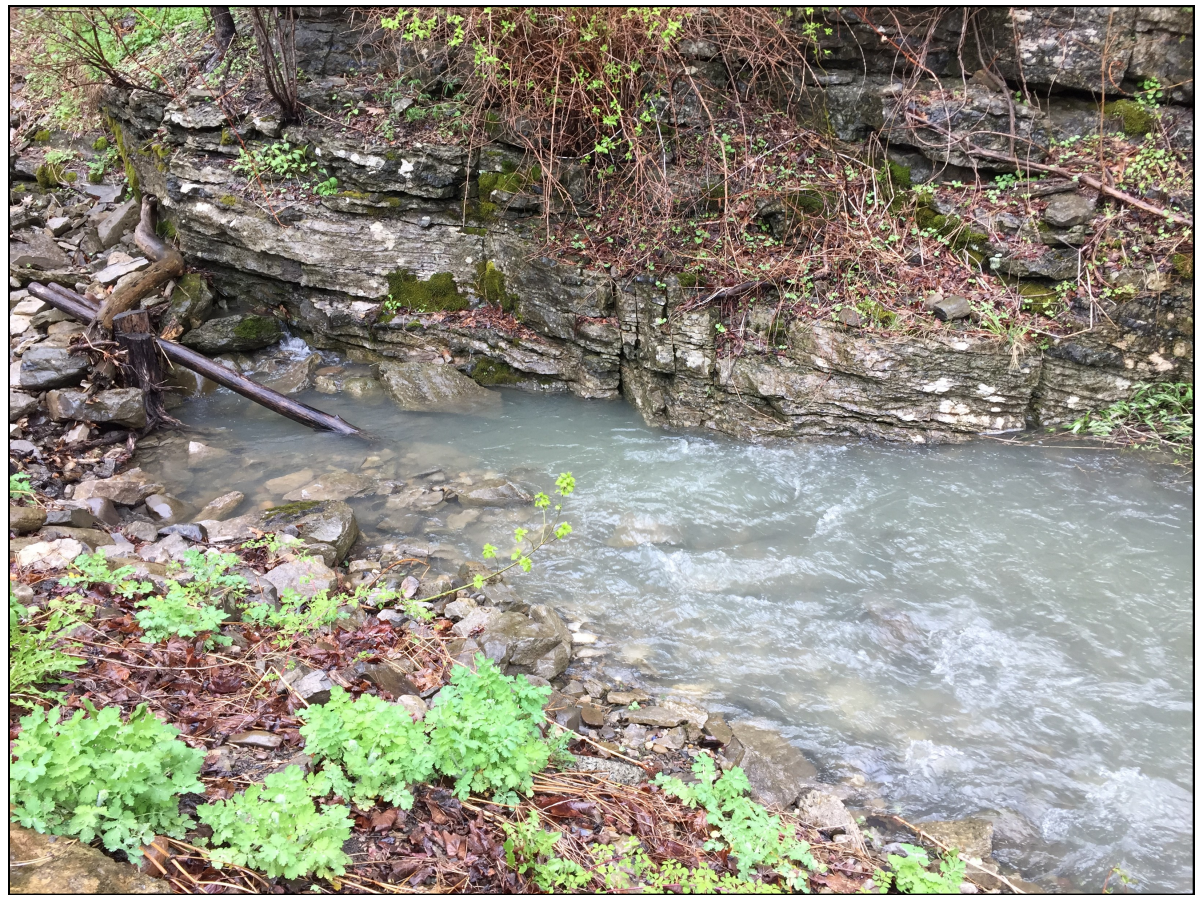
Overlooked beauty on the surface of the Clarksville Preserve in early May. Turkey tail fungus on a fallen tree trunk and Osborne Cave overflow under high water conditions.