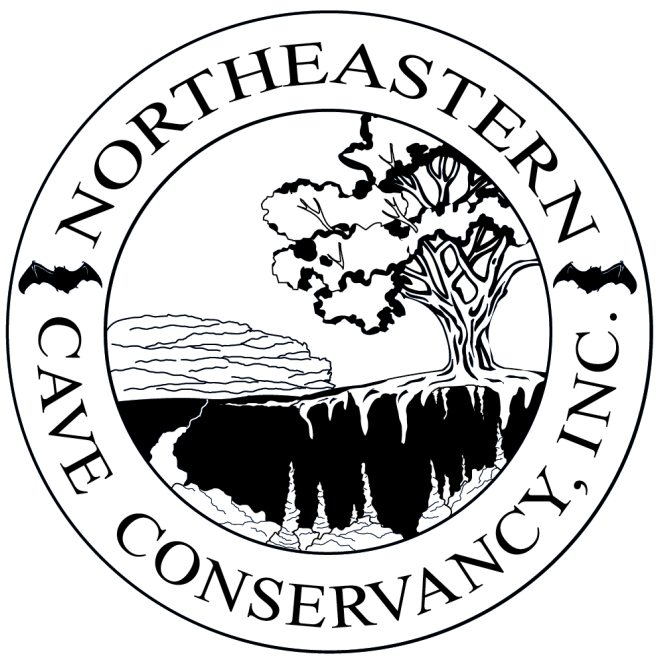
NCC logo design by Christa Hay

NCC members assist in the exploration, survey, and protection of these natural resources, and manage them so you can explore them yourself.