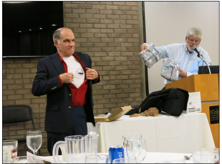
Northeastern Cave Conservancy 40th Anniversary Dinner.