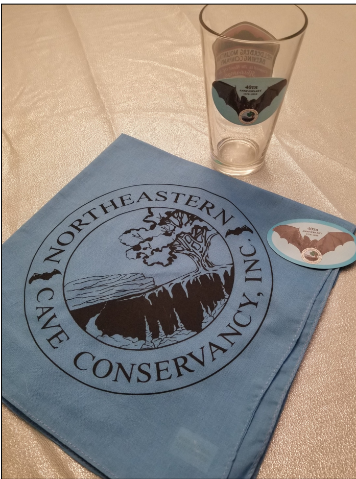
Complimentary gift items received by dinner attendees.