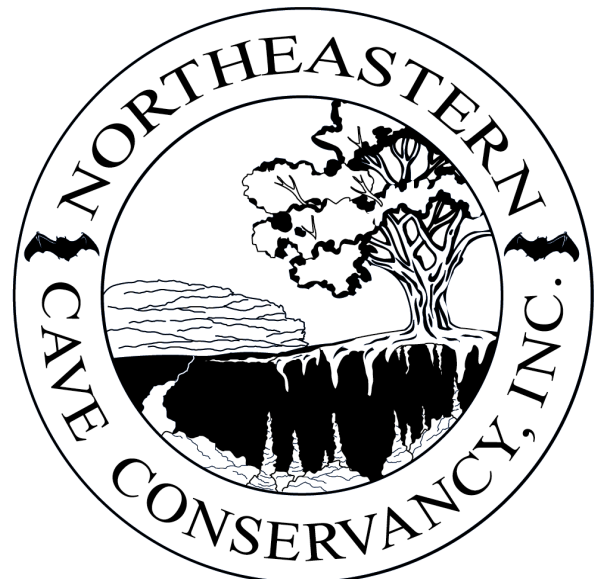
NCC logo design by Christa Hay

NCC members assist in the exploration, survey, and protection of these natural resources, and manage them so you can explore them yourself.