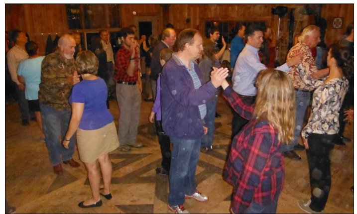
Ninth Annual NCC Barn Dance. Octagon Barn. Knox, New York.