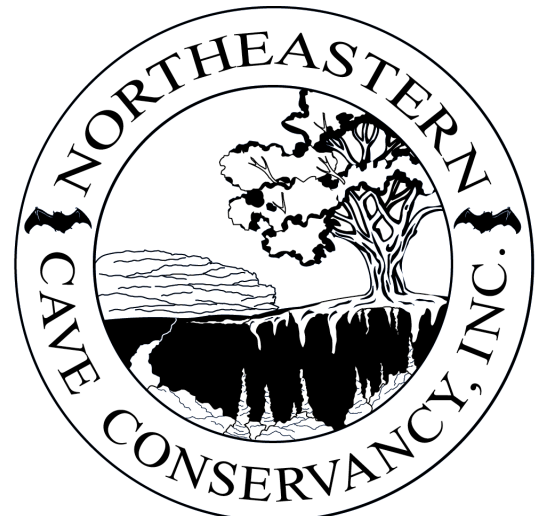
NCC logo design by Christa Hay

NCC members assist in the exploration, survey, and protection of these natural resources, and manage them so you can explore them yourself.