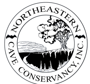
NCC logo design by Christa Hay