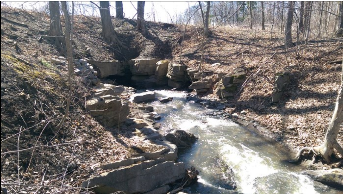
Onesquethaw Cave in spring flood, April 9, 2017.