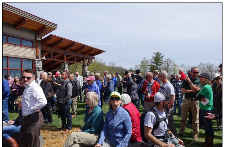
The dedication ceremony of the new visitor center (and kids' cave) at the John Boyd Thacher State Park marks the beginning of a new era in helping to spread the word about mission of The Northeastern Cave Conservancy.