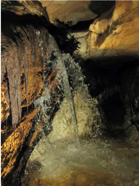
Growling Bear Cave waterfall