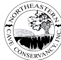
NCC logo design by Christa Hay