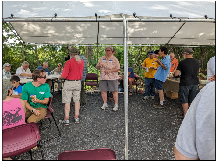
All photos on pages 5 and 6 by Norm Berg.