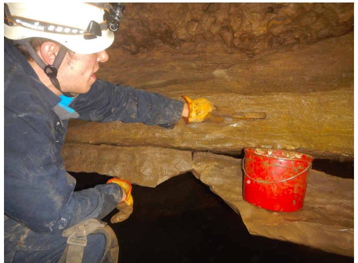
CLARKSVILLE CAVE CLEANUP MAY 20, 2023